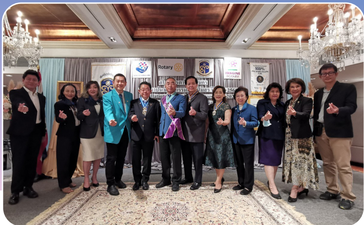
RC Charoen Nakorn