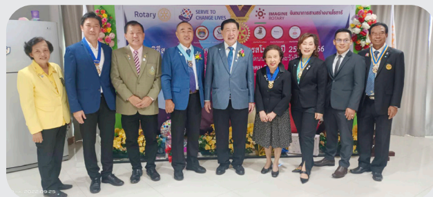
Rotary clubs in Nonthaburi