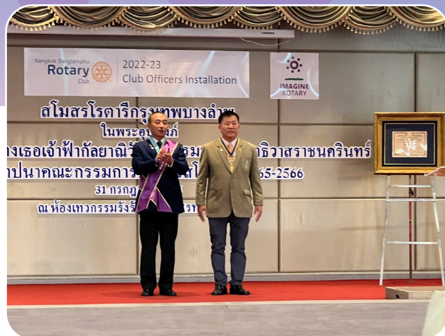
RC Bangkok Banglamphu